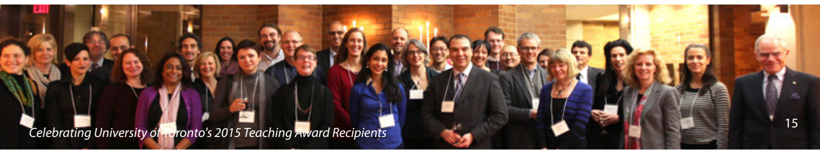
Celebrating University of Toronto's 2015 Teaching Award Recipients

CTSI's external partnerships include government and professional organizations. We continue to collaborate and publish with the HIGHER EDUCATION QUALITY COUNCIL OF ONTARIO (HEQCO) (see Appendix __ for a list of publications). Many CTSI staff members belong to the Society for Teaching and Learning in Higher Education, the Consortium of Ontario Educational Developers and the Educational Developers Caucus, and the International Society for the Scholarship of Teaching and Learning, and regularly present at national and international conferences on pedagogical matters.